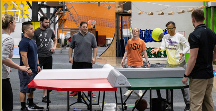
Table games are familiar and memorable activities for groups to enjoy, regardless of age or physical ability. We have compiled an entertaining series of table games such as Table Tennis, Foosball, Giant Jenga, Carpetball, Poly Pong, Whip-and-Skip, Flap Attack, and more.